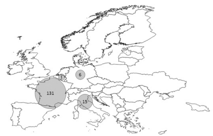
Figure 2 Published cases related to the European indigenous outbreak and patients' nationality.