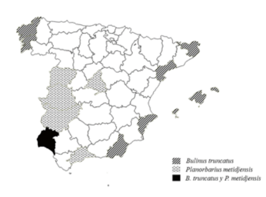
Figure 3 Spanish provinces where the presence of Bulinus truncatus and Planorbarius metidjensis specimens has been documented.